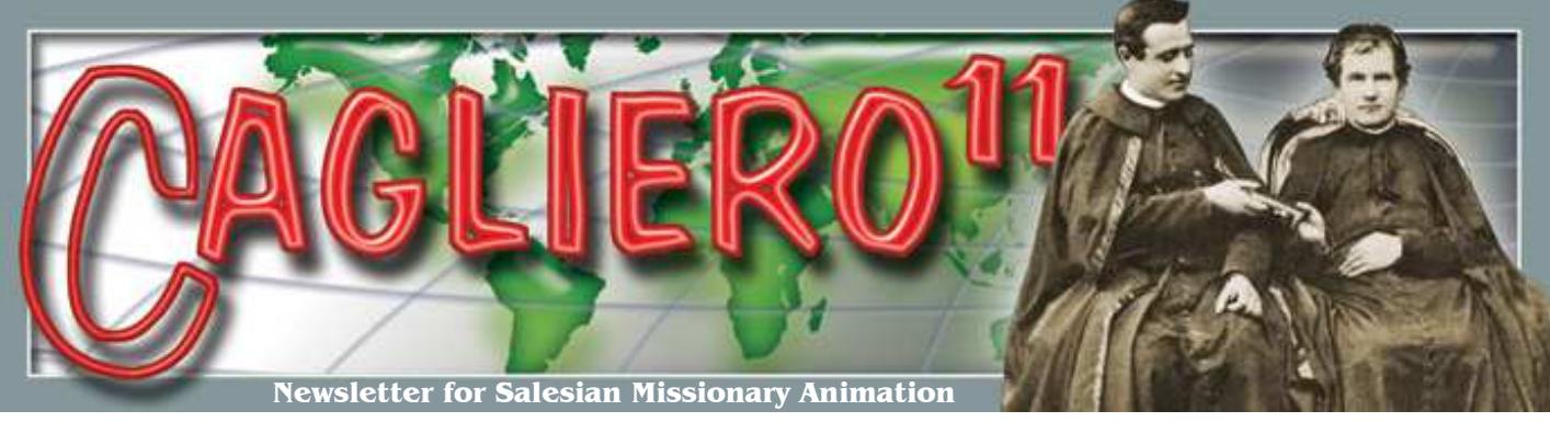
A Publication of the Mission Department for the Salesian Communities and Friends of the Salesian Mission